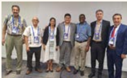
Oral Presentation at the the session of "OSH in Low- and Middle-Income Countries (LMICs)-Sharing Good Practices"