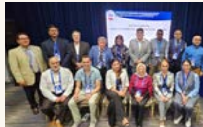
Business meeting of SC On Occupational Medicine (SC OM)