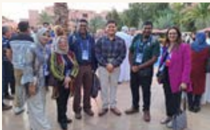
Top 5 at ILO Master Fellowship Competition